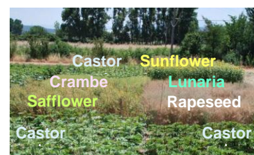
Fig. 1. Field trials for oil crops in Greece, July 2011.

In the various test fields in Poland, Greece (example in Fig. 1) and Madagascar, 5 lignocellulosic plants (willow, giant reed, miscanthus, switchgrass, cardoon) and 7 oil crops (castor, crambe, safflower, lunaria, jatropha, as well as sunflower and rapeseed for comparison) were grown according to smart rotation strategies, and