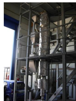
Fig. 3. Gasification unit in Greece.

Some samples exhibit excellent properties, with a high specific surface area. The possible applications of such upgraded solids are investigated in the biorefinery concept. Indeed, they can be used as, e.g., absorbents or catalysts supports.