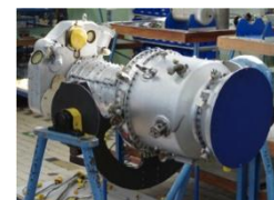
Jet A1 test engine.

via chemistry to be blended as components of aviation gasoline and jet fuel, in VC5, two main routes are considered for the production of alcohols, the first one via syngas production and alcohol synthesis and the second one via fermentation of sugars hydrolysates with butanol as a platform molecule. The progress done so far in this VCs is satisfactory although they remain challenging. In the last period the efforts will be intensified in order to complete techno-economic analysis, business plans, bench mark with competition and LCA analysis.