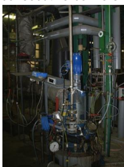
Pilot for chemical reactions.