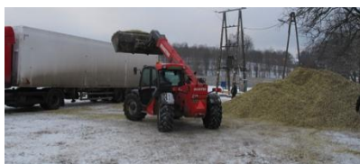
Willow chips loading.

Value Chain 6: Integration of EuroBioRef technologies in existing assets. VC6 offers a framework to consider EuroBioRef chemistries and technologies as additions to existing, preferably European plants. Several such “co-location” scenarios have been proposed as modifications of VCs 1 to 4, VC5 being a co-location model by itself. On the other hand, 11 co-location models have been identified for EuroBioRef conversions, which are not studied