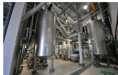
Lignocellulosics fractionation unit.

in any of the other VCs. The work is re-focusing on the most promising value chains. With the addition of the 2 products coming from VC4, Value chain 6 seeks to demonstrate in which cases it makes sense to add a biobased production in an existing asset (plant) and capitalize on skilled personnel, available infrastructure, and plant integration. In this case, the Integrated Biorefinery is looking at the integration of a biobased product in a fossil (or bio) existing asset.