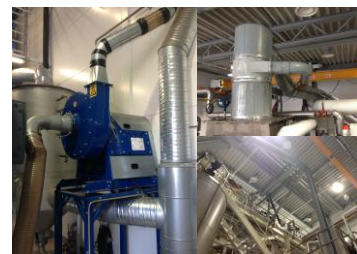
Castor processing unit.

Value Chain 3 & 5: Fuels and syngas derived products. These Value chains relate to the production of "ATF" used for aviation fuels (VC3) and to the conversion of black liquor to syngas-derived products (VC5) including alcohols. Then, VC3 is closely related with VC5 as both share the same route of syngas production via gasification and its consecutive conversion to alcohols. However, while VC3 considers the production of heavy alcohols/branched paraffins