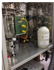
Higher alcohols production unit.

Value Chains 1 & 2. Both value chains are dealing with vegetable oils and are, at the moment, the most advanced ones. The purpose of VC1 is to start from castor to a high value monomer with some co-products being used as fuel. VC 2 starts with oleaginous crops (Crambe, Safflower) producing high value monomers and short fatty acids, suitable for fuel application once esterified. VC1 and VC2 have several steps in common; beside the market for end products, several transformation steps are in common. Both VCs have the possibility to start from castor, crambe and safflower. Further, a route was, e.g., proposed to the Castor Oil (VC1) and combines it with the chemistry of VC2 to deliver monomers even more interesting than those initially planned in VC2. Thus, as aforementioned, due to similarities and to common outputs, these Value Chains have been merged.